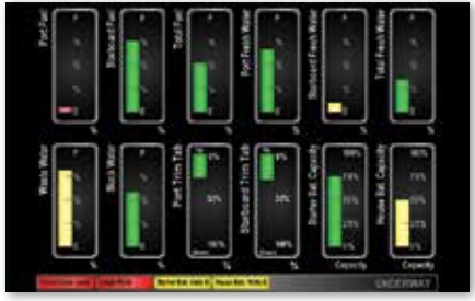
MBB300C Screen Shots